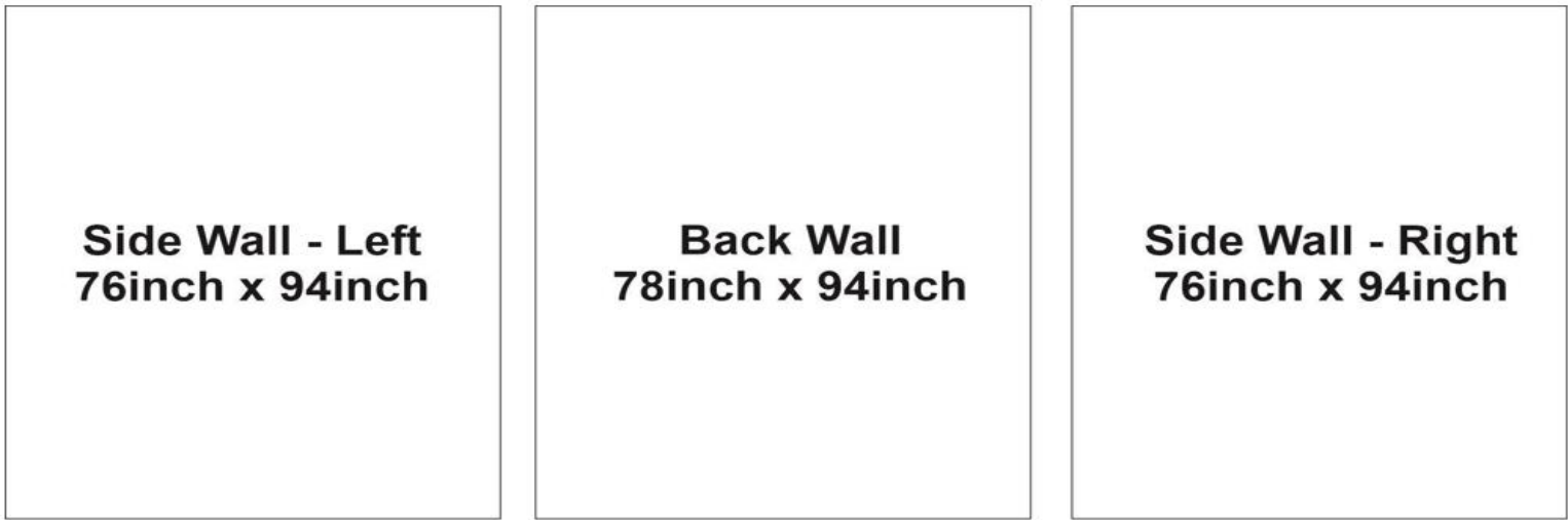
Graphic Sizes for boot 2m x 2m